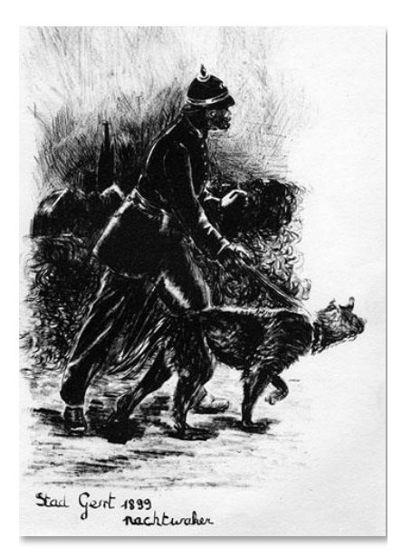
The Night Watch