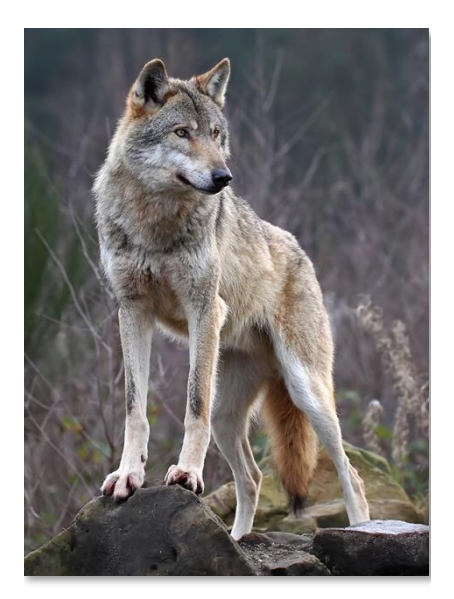
The Grey Wolf

How could this existential crisis have come to pass? As with most deep seated societal change it has been a complex and convoluted saga; here we shall explore the realities at play leading to this unhappy state of affairs.