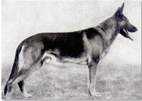
Klodo vom Boxberg set a new direction for the breed when von Stephanitz made him Sieger in 1925.

If the breed is to be rebuilt on the police dog foundation then although the hour is late redemption is potentially within reach. As a result of the recent Euro court rulings the SV and WUSV find themselves in a significantly enhanced position to exert international influence over German Shepherd affairs, particularly as regards conformation, working trials, breeding eligibility and registration. In order to gain success hegemony must be exerted with wisdom and finesse, recognizing and accommodating the rights and legitimate interests of the GSD communities in client nations.